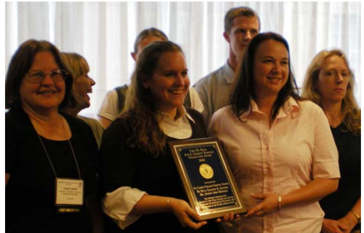
First Place: Carroll Community College (MD), pictured above. Special Recognition: Cerritos College (CA)