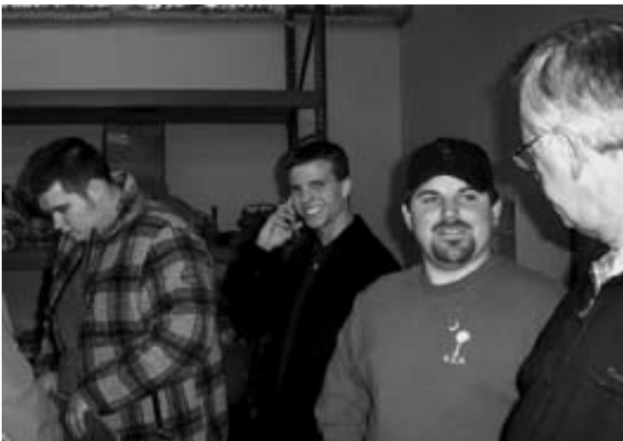
Spartanburg Methodist College (SC) Psi Beta members are shown on their field trip to Holmesview Addiction Institution.